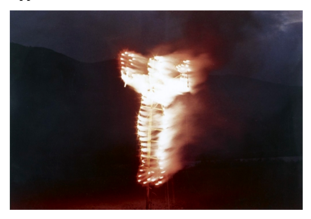
Fig.1. Ana Mendieta, "Anima, Silueta de Cohetes (Firework Piece), 1976". Art Basel, For sizing purposes this photograph is retrieved from the web site Art Basel, 2016, <a href="https://www.artbasel.com/catalog/artwork/46826/Ana-Mendieta-Anima-Silueta-de-Cohetes-Firework-Piece">https://www.artbasel.com/catalog/artwork/46826/Ana-Mendieta-Anima-Silueta-de-Cohetes-Firework-Piece</a>.

For sizing purposes, this photograph is a snapshot of the video performance retrieved from the web site Art Basel. The rest of the photographs in the Appendix are referenced in the Works Cited page.