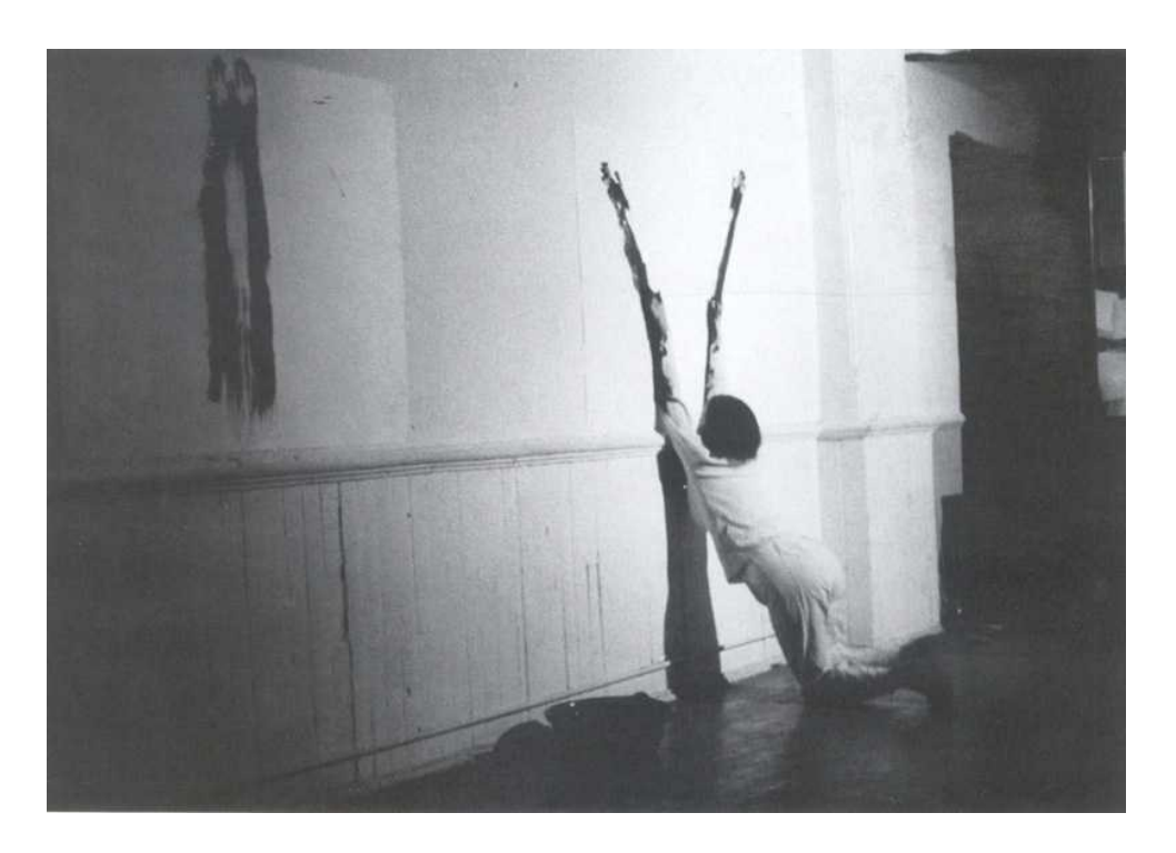
Fig.2. Ana Mendieta, Body Tracks (Rastros Corporales) 1982 . Photograph taken during a performance at Franklin Furnace, New York City, 1982.