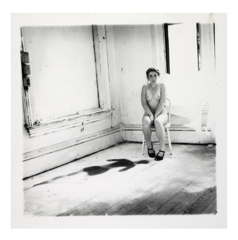
Fig. 5. Francesca Woodman, Untiled, Providence Rhode Island, 1976