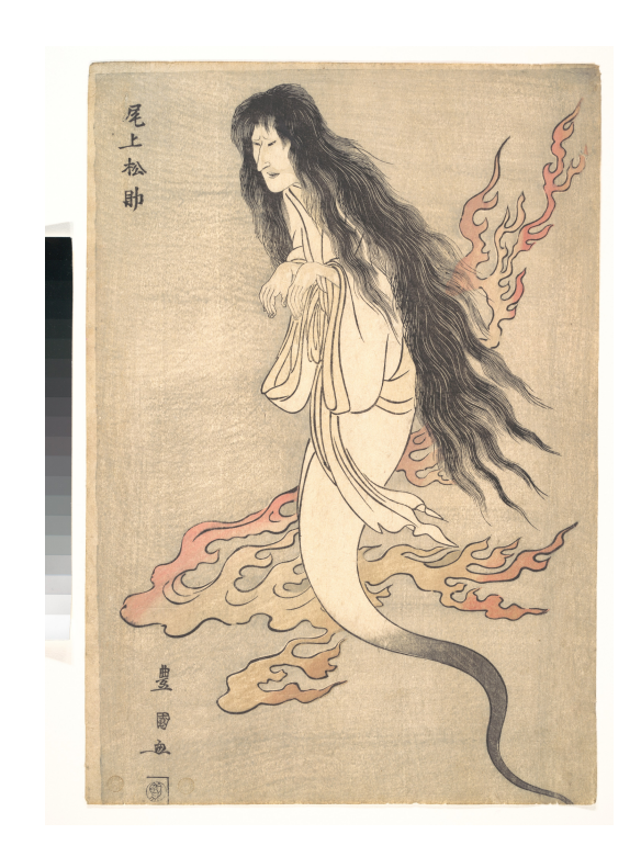
Figure 2: Onoe Matsusuke as the Ghost of the Murdered Wife Oiwa, in " A Tale of Horror from the Yotsuya Station on the Tokaido Road", Utagawa Toyokuni, 1812.