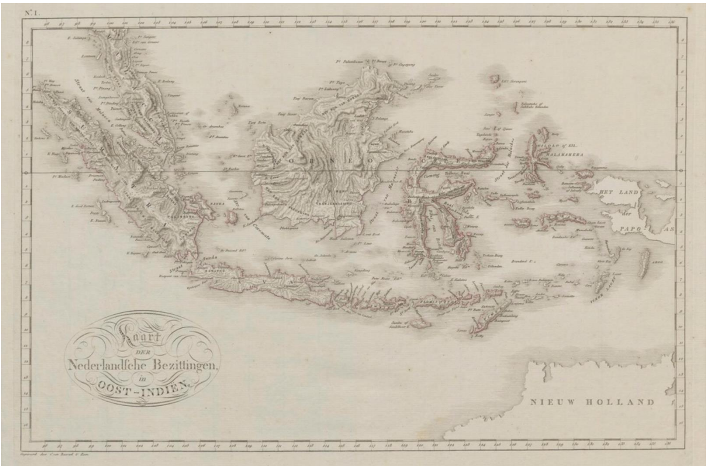
Figure 3: 'Kaart van Nederlandsche Bezittingen in Oost Indiën' (van den Bosch 1818).