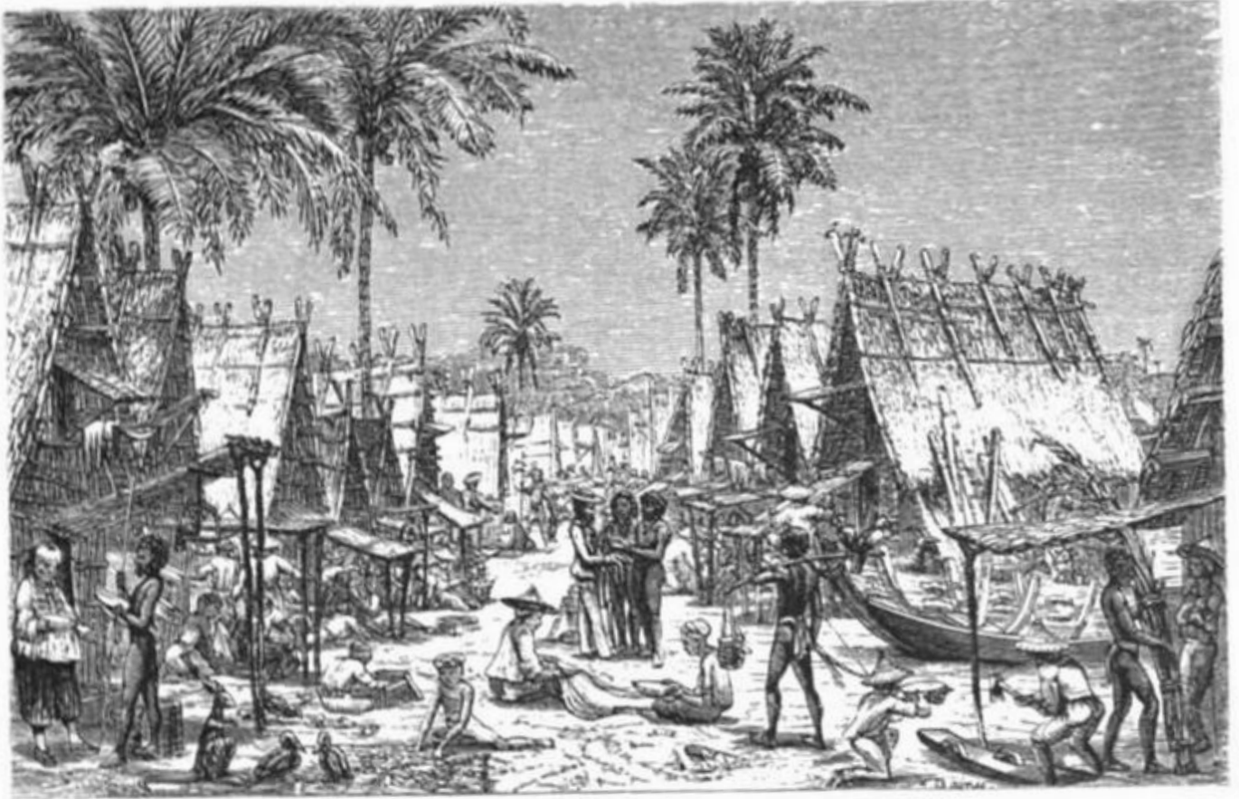
DOBO IN THE TRADING SEASON.