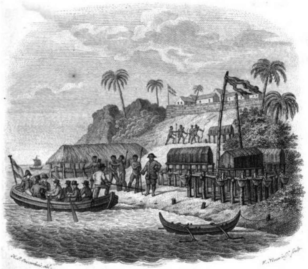
BEGRAAFPLAATS VOOR AWEER.