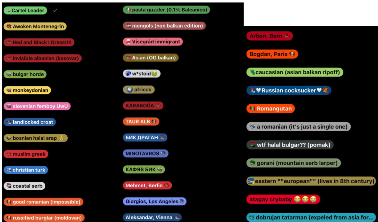
Figure set 1

This exaggerated focus on ethnicity on the Subreddit is also perpetuated in other ways, there is a list of user flairs that function as user identifiers. In my experience with "flaring up" as it is said online, I had to choose an ethnic label that would accompany my username, a list of which is found in figure set 1 to give some ideas.