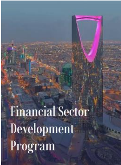
Figure 2. Example of an image on the Saudi Vision 2030 website with the theme ‘modern city’.