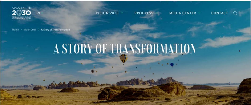
Figure 1. Example of an image on the Saudi Vision 2030 website with the theme ‘nature’.