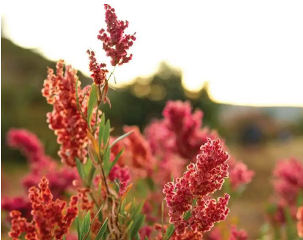
Figure 5. Example of an image on the Green Initiative website with the theme ‘energy’.

The most frequently featured visual theme on the Green Initiative website is ‘landscape’. This suggests that the website wants to show its users the beautiful nature that Saudi Arabia has to offer. This category is, however, skewed by the reappearance of the same picture of a landscape at the end of many (sub)pages, which also includes text inviting visitors to sign up to receive updates, 25 times. This indicates that the KSA wants to actively involve the visitors, hoping to draw them back to the website. The next theme is ‘energy’, which makes up over 17% of all the images on the website. This shows that Saudi Arabia wants to show the visitors of this website that it gives a great deal of attention and importance to the topic of (renewable) energy. Within this theme, there are two main motifs, namely solar panels which are featured 20 times and windmills, which are featured 21 times. The theme ‘person’ is also prominent, mainly because the local speakers at a forum are all introduced