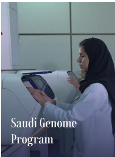
Figure 3. Example of an image on the Saudi Vision 2030 website with the theme ‘science’.

The most important visual theme on the Saudi Vision 2030 website is nature, which comprises almost 21% of all the pictures. As images provide the website’s visitors with an impression, it seems Saudi Arabia wants the users to get the impression that nature plays an important role in Vision 2030. The themes ‘Modern city’, ‘industry’, and ‘business’ can all be connected to the economy, showing that Saudi Arabia wants the website to reflect the importance of (improving) the economy within Saudi Vision 2030. Similarly, the themes ‘industry’, ‘business’, and ‘hospitality/tourism’ all relate to employment, another aspect of Vision 2030 which the government apparently wants to highlight. The prevalence of the