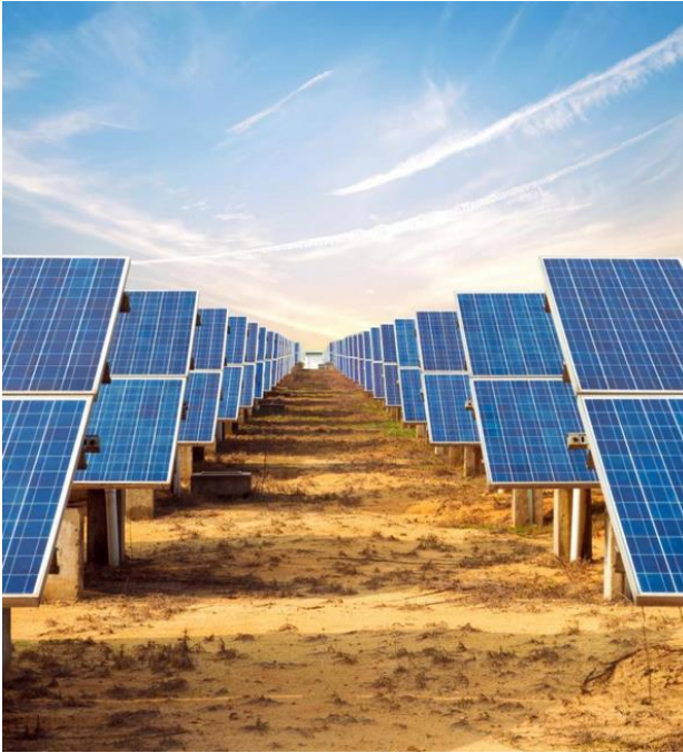
Figure 5. Example of an image on the Green Initiative website with the theme ‘energy’.