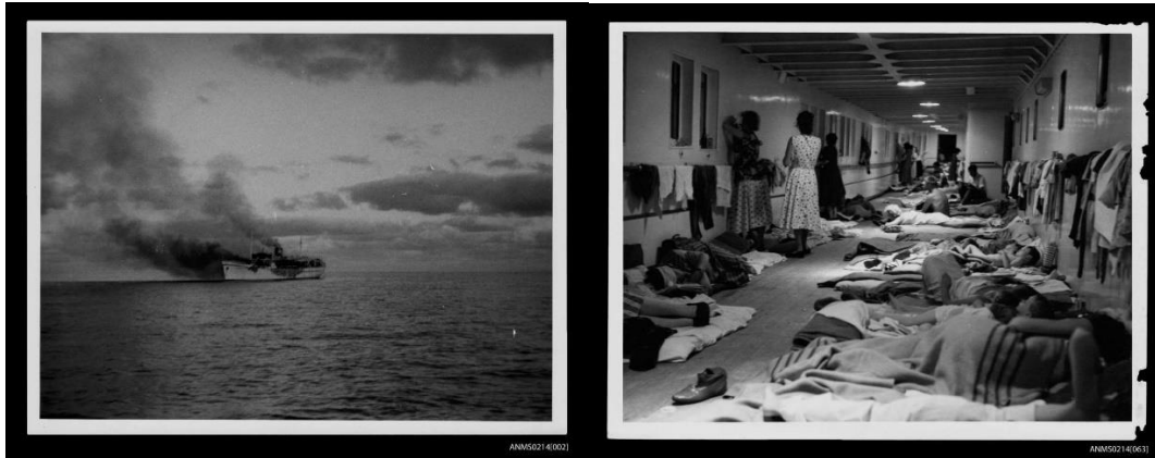
Figure 2 Port bow view of Skaubryn on fire in the Indian Ocean and temporary accommodation for Skaubryn survivors on the deck of Roma, 1958. ANMM Collection Gift from Barbara Alysen ANMS0214 [002]and [063]. Reproduced courtesy International Organisation for Migration. 9

This episode has caught the attention of numerous historians and institutions with the ‘Saga of the Skaubryn ’ memorialised in song, as well as in publications and exhibits supported by institutions such as Australia’s National Maritime History Museum. In their totality, such accounts speak to a grand-narrative of history regarding post-war immigration which underscores the perilous journeys immigrants undertook in search of a better life in the ‘promised land’ of Australia.