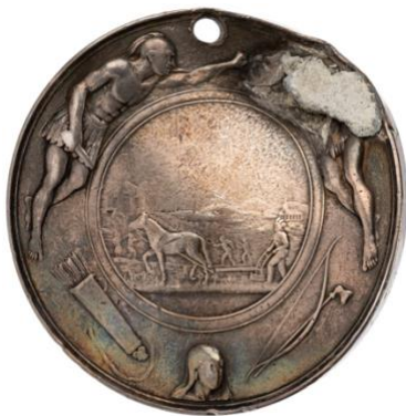
Figure 22. Reverse Silver Medal of Lincoln, Abraham, United States with crater from impact of bullet (embedded bullet still intact), 1862. Engraver: Joseph Willson. Collection: American Numismatic Society © American Numismatic Society.