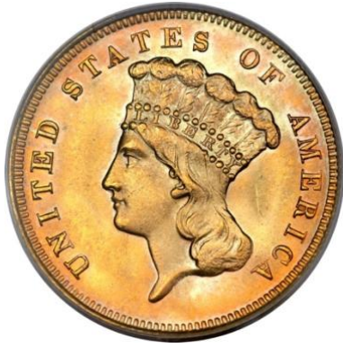
Figure 3 Obverse 3-dollar “Indian Princess Head”, 1878. Engraver: James B. Longacre © Heritage Auctions.