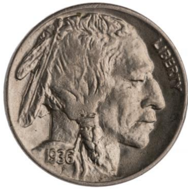
Figure 7. Obverse Cupronickel 5 cent of The United States, 1913. Engraver: Augustin Dupre. Collection: American Numismatic Society © American Numismatic Society.