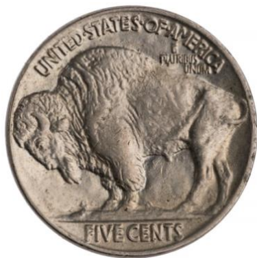
Figure 8. Reverse Cupronickel 5 cent of The United States, 1913. Engraver: Augustin Dupre. Collection: American Numismatic Society © American Numismatic Society.

Although not specifically chosen for this coin, the phrase “E PLURIBUS UNUM,” meaning “Out of many, one,” adds to the paradox of the Buffalo Nickel. The phrase has been a standard element of U.S. currency since 1795. It appeared in the Journals of the Continental Congress on June 20, 1782, where it was used to describe the Great Seal of the United States. The phrase became legally required on all U.S. coinage after February 12, 1873, and appeared on the back of U.S. $1 notes since 1935. The juxtaposition of this unifying motto with imagery that commemorates Native Americans while also contributing to the myth of the ‘vanishing Indian’ further complicates the meaning of the coin. 65