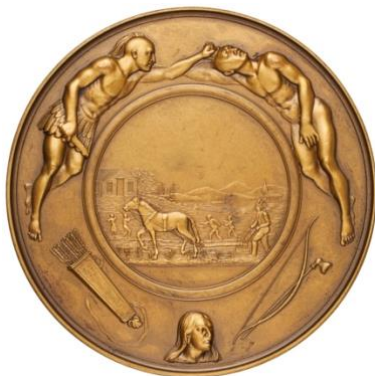
Figure 20. Reverse American Indian Peace Medal, President Millard Fillmore, 1850 (replica). Collection: Numismatics & Philately © Museums Victoria.