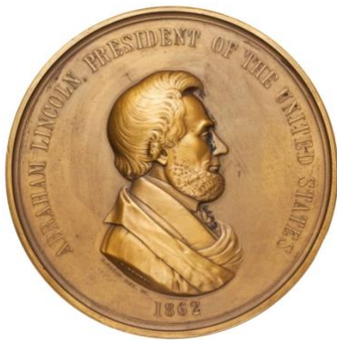
Figure 19. Obverse American Indian Peace Medal, President Millard Fillmore, 1850 (replica).

In the scene on the Abraham Lincoln medal as can be seen in Figure 20, the house in the background, children playing baseball, and the farming methods suggest that the assimilation was successful; the Native American man has become a farmer, adopting a lifestyle that fits into white society. The presence of the church in the background also indicates that Native Americans have embraced Christianity. It is likely no coincidence that the children are shown playing baseball. Around the 1850s, baseball emerged during a significant rise in political and cultural nationalism into a national pastime activity in the United States. 114 In contrast to the assimilated lifestyle of the Native American in the central medallion described above, the outer border depicts a lifestyle regarded as violent according to white society standards, which he has left behind. A Native American warrior holds a knife to scalp another Native. Below the head of a female Native American is depicted, surrounded by a bow, arrows, and a peace pipe.