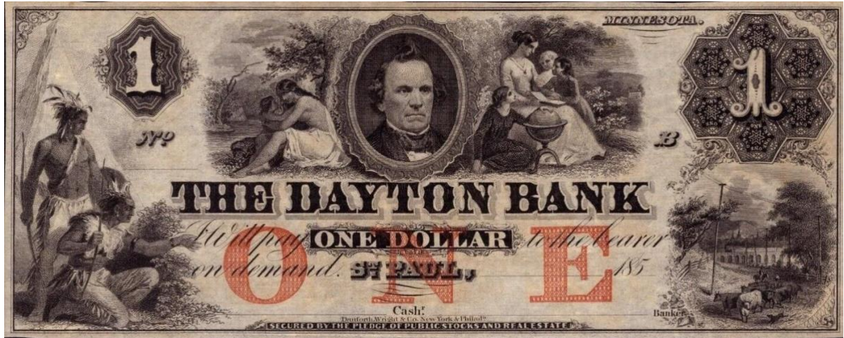
Figure 12. Obverse 1 Dollar The Dayton Bank Minnesota, Maker: Danforth, Wright & Co, 1853-1859.

To conclude, the banks from the Free Banking Era made image choices for their banknotes in consultation with security-engraving firms. Similar to the design of the Indian Head Cent, the concept of portraying a “typical American” image seemed to be an essential part of the thought process of the security-engraver firms. This might be the reason why banks chose vignettes of Native Americans. These images may have functioned to build customer trust by projecting an American identity. Therefore, the choices to depict Native Americans on these pre-federal banknotes appear to have been made intentionally. What is known, is that security firms in the Free Banking Era featured Native Americans on their banknotes as part of the country’s proud heritage. 87 These images contributed to the formation of a ‘new typical American’ identity.