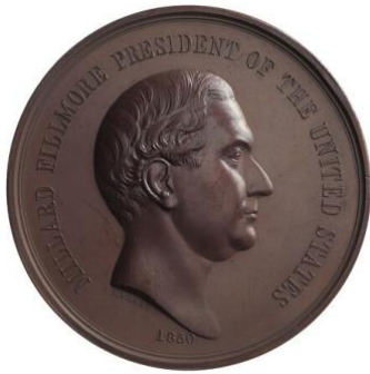
Figure 17. Obverse American Indian Peace Medal, President Millard Fillmore, 1850 (replica).

Examining the Indian Peace Medals, the “Labour, Virtue, Honor” medal shown in Figures 17 and 18, issued during the presidencies of Millard Fillmore (1850–1853) and Franklin Pierce (1853–1857), appears closely related to the later Abraham Lincoln Indian Peace Medal. 112113 Together the medals seem to tell a narrative where Native Americans are taught “civilization” by the white man.