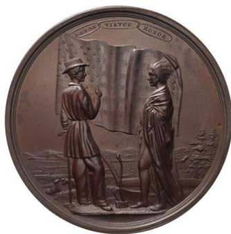
Figure 18. Reverse American Indian Peace Medal, President Millard Fillmore, 1850 (replica). Collection: Numismatics & Philately.