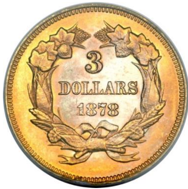
Figure 4 Reverse 3-dollar “Indian Princess Head”, 1878. Engraver: James B. Longacre © Heritage Auctions.

Looking at the three-dollar piece, two things stand out. First, the head on this coin does resemble that of the portrait on the Indian Head cent. Secondly, the figure is wearing a headdress of a Native American princess. The three-dollar piece was designed in 1854, while the Indian Head cent was created in 1858, both by James B. Longacre. This indicates that Longacre was aware of the existence of different types of Native American headdresses. This makes his choice to depict a headdress intended for a Native American man, on a European woman even more interesting. This may suggest that, as the designer of the coin, Longacre applied creative liberty to use an item from another culture. His designs had to be different to avoid confusion between coins. Still, this choice may suggest that the cultural background of the headdress has not been considered and that the visual aspect was more important. Furthermore, Longacre may have been inspired by the Diplomatic Medal, which also features a Native American wearing a headdress as can be seen in Figure 6.