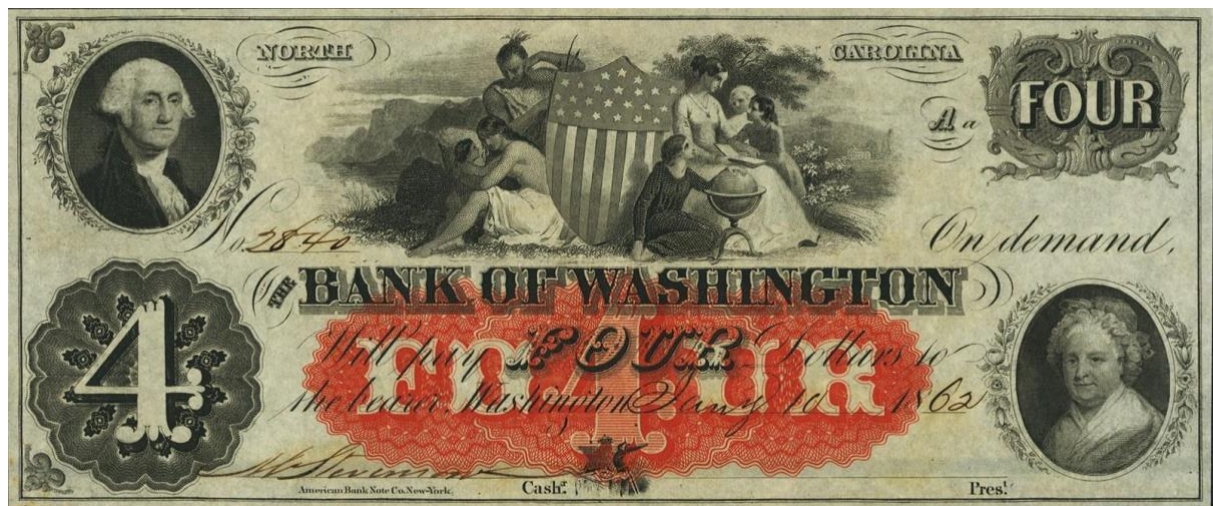
Figure 11. Obverse 4 Dollars The Bank of Washington North Carolina, 1851-1864. Maker: American Banknote Company.

Figure 11 displays, a 4-dollar bill printed by the American Bank Note Company and, issued by The Bank of Washington from 1851 to 1864. 83 The banknote below features the same vignette in the center as the previous one, but the two scenes are divided by a shield. A portrait of George Washington appears on the left side of the banknote.