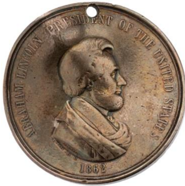
Figure 21. Obverse Silver Medal of Lincoln, Abraham, United States with crater from impact of bullet (embedded bullet still intact), 1862. Engraver: Joseph Willson.