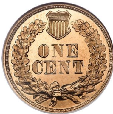
Figure 2 Reverse Indian Head cent, 1862. Engraver: James B. Longacre.