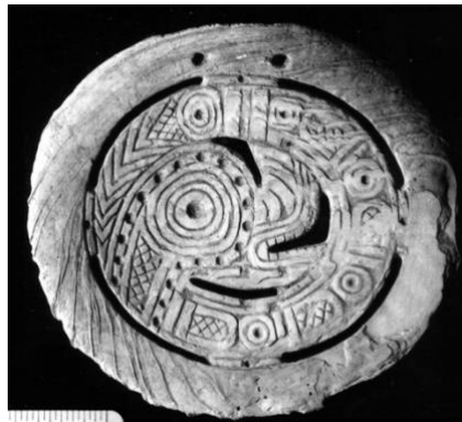
Figure 16. Snake Monster, Brakebill South variety, A.D.1400-1600.

stone. 100 Other analyses suggest that political and kinship associations from the designs on shell gorgets have a similar purpose as those that later appear on European and American peace medals. Forensic and archaeological investigations have found that in certain tribes, individuals regarded as important wore gorgets in specific styles and themes, similar to how significant Native American figures wore Indian Peace Medals. Both objects identified the wearer as an elite within their tribe and connected him to the power of the person depicted on the object. 101102 Finally, shell gorgets and the later Indian Peace Medal represent a political order, kinship relation, and power source. 103 While Native Americans created and wore shell gorgets, European colonists, possibly influenced by philosophers, viewed them as a violent threat to be eliminated.