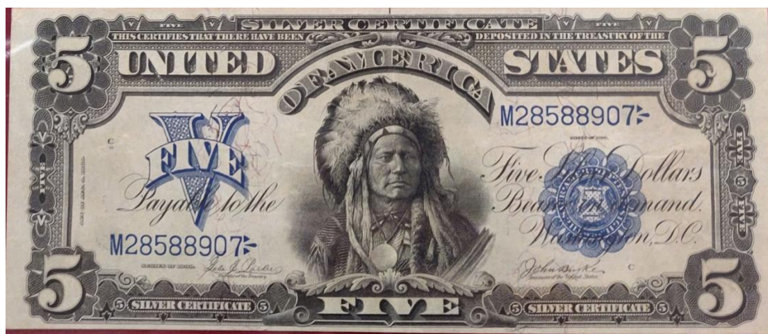
Figure 13. Obverse 5 Dollars Silver Certificate “Indian Chief Note.” Engraver: George F.C. Smille, 1899. © Sonny Darko.

The main difference with the Indian Chief Note, which can be seen in Figures 13 and 14, is that it shows the bust of a Native American, unlike the full-body depictions of “nameless” figures from the Free Banking Era. In 1878, Congress gave the United States Bureau of Engraving and Printing the monopoly on the production of United States currency. The BEP replaced private companies that had produced banknotes for years. 89 The Blank-Allison Act of February 28, 1878, allowed the Treasury to exchange the deposit of silver coins for Silver Certificates. This was allowed to provide another option than to carry silver dollars. In 1886, Silver Certificates of 1, 2, and 5-dollar denominations were issued. These types of banknotes became popular and were used for much of the late 19th and 20th centuries. 90 The Indian Chief Note is a 5-dollar Silver Certificate. 91 This paper bill is part of the series of 1899. Other banknotes in this series include a 1-dollar Silver Certificate and a 2-dollar Silver Certificate. The 1-dollar banknote depicts an eagle standing on a United States flag with the Capital Building in the background at the center of the banknote. At the bottom, below the eagle, two small busts of Abraham Lincoln and Ulysses S. Grant are depicted. 92 On the 2-dollar Silver Certificate, the bust of George Washington is in the center bottom of the banknote. 93