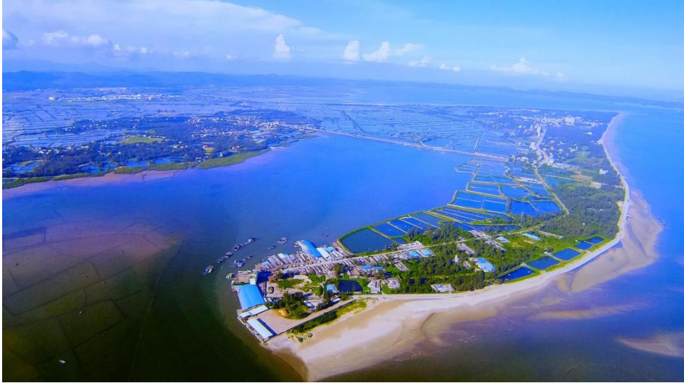
Figure 4, land reclamation and the construction of seawalls.

Photos from Peilin Li took in the Jing museum.