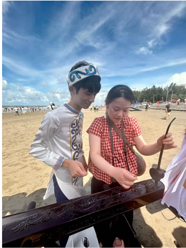
Figure 8, in Golden Beach, 14 July 2024.

During the my fieldwork, an interview was conducted with a Vietnamese tourist who had traveled a long distance. He expressed that when he saw the Jing people wearing traditional attire, playing the Đàn Bầu, and conversing with him in Vietnamese, he felt a deep sense of familiarity and was reminded of Vietnam's Ha Festival, despite the significant differences between the Ha Festival rituals of the Jing people and those in Vietnam. Whether in the traditional sacrificial rituals of the Ha Festival or in the modern convergence of ethnic cultures, this festival evokes shared historical memories between the Jing and Vietnamese peoples. It not only strengthens the internal connections among the Jing people in China but also enhances external connections between Jing communities in China and Vietnam, forming a bond of identity recognition and consolidating the ethnic consciousness of all Jing people.