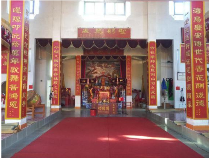
Figure 5, photo of Hating (哈亭) from Jianling Qi 2018, p63

The “娱神 (entertaining the gods)” ritual typically takes place after the “welcoming the gods” and “worshipping the gods” ceremonies 4 :