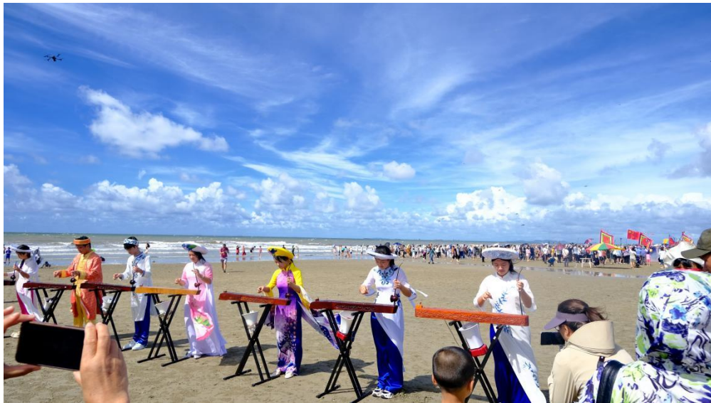
Figure 6, photo from Peilin Li in Golden Beach, 14 July 2024.

This observation may explain why, in 2024, the local tourism and cultural bureau adjusted the number of Đàn Bầu performers and reorganized the setup, allowing visitors to approach the musicians more safely. This new arrangement not only satisfied the visitors' curiosity about the instrument but also addressed safety concerns, making the experience more engaging and secure for everyone involved. However, this change also had its drawbacks. Without a designated platform for the audience, visitors tended to unconsciously crowd closer to the Đàn Bầu performers, eventually creating a certain level of chaos. This disruption caused some performers to halt their planned repertoire midway to accommodate impromptu requests, such as interviews from television crews and hands-on demonstrations for curious visitors wanting to experience the Đàn Bầu themselves.