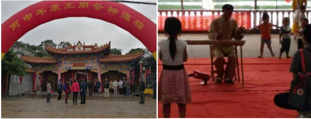
Figure 9&10, The Kang Wang Festival, photo from Qi Jianling 2018, 78.

In contemporary Jing-Han interwoven communities, the cultural role played by the Jing people's Đàn Bầu within the ritual spaces of other brotherly ethnic groups embodies multiple functions: promoting ethnic identity, fostering interethnic friendship, and facilitating the integrated development of national identity.