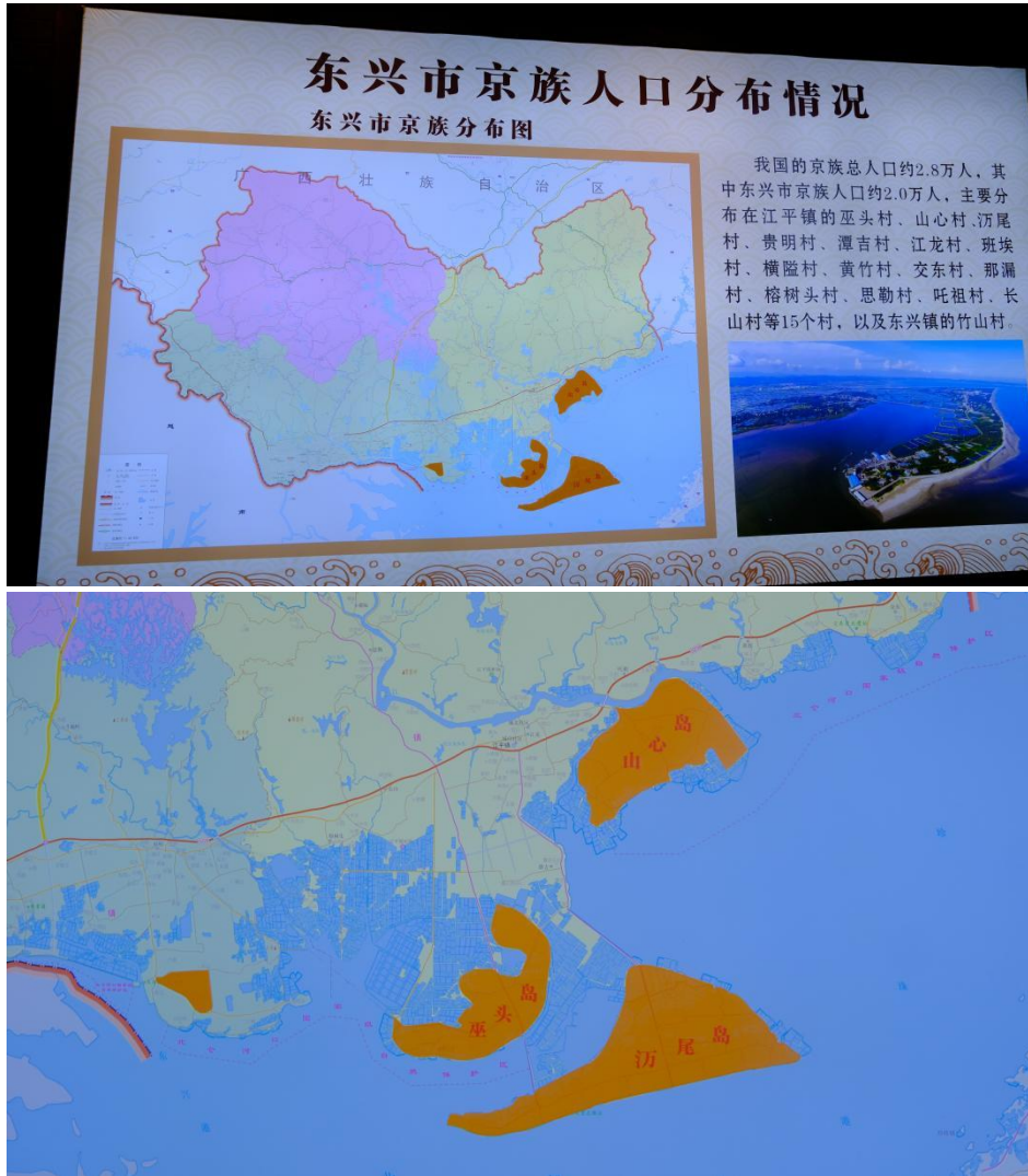
Figure 2&3, the three Jing Islands: Wutou Island, Wanwei Island, and Shanxin Island.

the accumulation of sand from the sea, these islands cover a total area of 26.83 square kilometers and lie close to the mainland. During low tide, it is possible to walk between the islands and the mainland. In the 1960s, land reclamation (figure 4) and the construction of seawalls permanently connected the islands to the mainland.