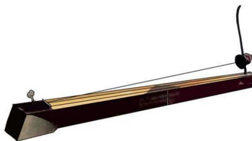
Figure 1, Đàn Bầu

Traditional Vietnamese musical performances are one way Vietnamese people have historically shaped and expressed their evolving narratives (Cannon 2016, 146-171). Similarly, the Chinese Jing, who share Vietnamese cultural roots, have drawn upon traditional Vietnamese music to articulate and reshape their identities. Among these musical traditions, the Đàn Bầu , a monochord instrument 1 (figure 1) with profound cultural and historical significance, holds a particularly important role in the Jing ethnic group's identity expression.