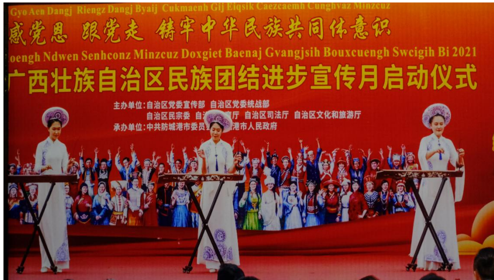
Figure 11, Đàn Bầu in opening ceremonial event, photo from Peilin Li took in the Jing museum.