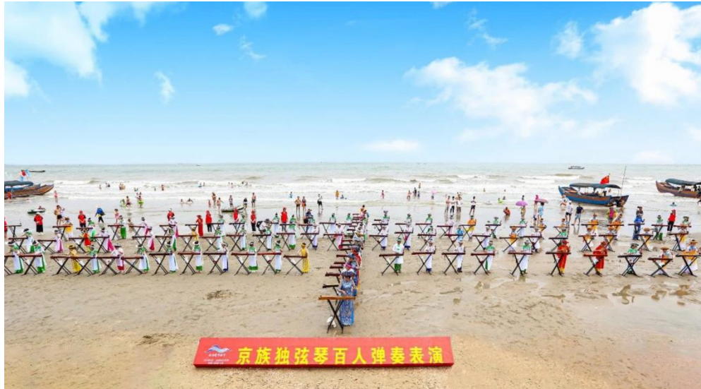
Figure 7, photo from social media WeChat Official Account: 青春防城港

https://mp.weixin.qq.com/s/IvYp5BSIL9eDyKtrHNOz5g