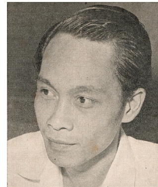
Figure 4 Pramoedya Ananta Toer, as featured in Kesusasteraan Indonesia Modern dalam Kritik dan Esei I.