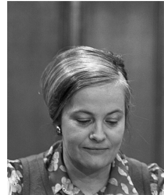
Figure 2 Hella S. Haasse