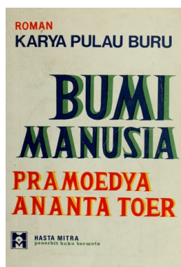
Figure 3 Book cover of Bumi Manusia by P.A. Toer, 1980.

Bumi Manusia tells the story of Minke, a native who attends HBS ( Hogere Burgerschool ). Minke was born into a Javanese aristocratic family. His father was a regent. Because he was born into this family, he had the privilege of attending an elite school where most students were European children. In this novel, Minke often faces racial discrimination, from his school environment to the law and courts. Even Minke, a nickname in the novel, comes from his teacher. Minke is a diminutive of monkey, a racist behavior that occurs even in school. Nevertheless, he continues to fight for his right to be respected as an individual, regardless of his skin color and background.